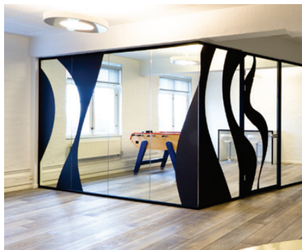
DEKO FG WITH BLACK POWDER COATED PROFILES