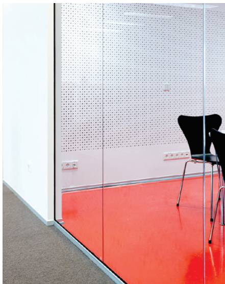
DEKO FG WITH CONCEALED PROFILES IN THE PARTITION