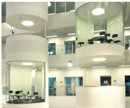
DEKO FG WITH CURVED GLASS