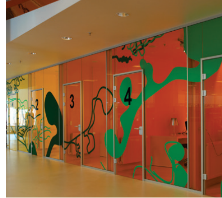
DEKO FD - FULLY GLAZED DOOR