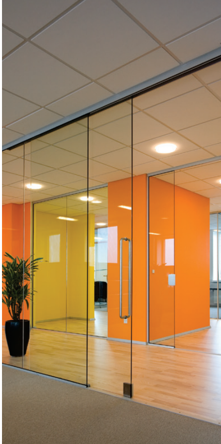
DEKO FD - FULLY GLAZED FRAMELESS SLIDING DOOR, TOP HUNG