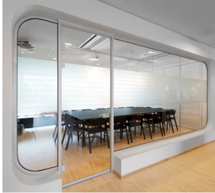
DEKO FD - FULLY GLAZED DOOR WITH ACOUSTIC STRIP