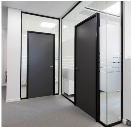
DEKO TD - SOLID TIMBER DOOR