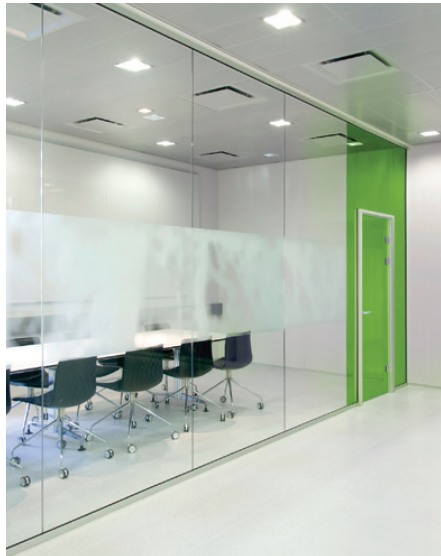
DEKO FG WITH NATURAL ANODISED PROFILES