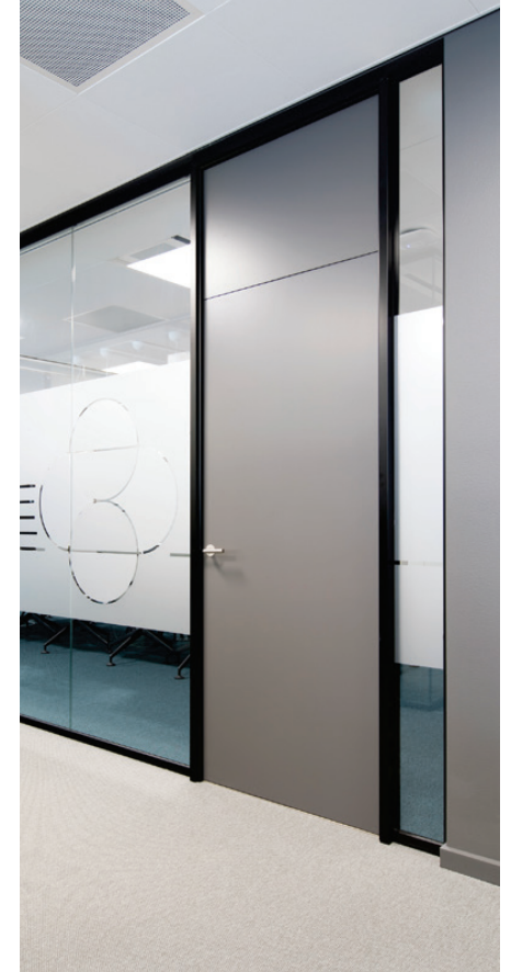
DEKO TD - SOLID TIMBER DOOR WITH OVERHEAD PANEL